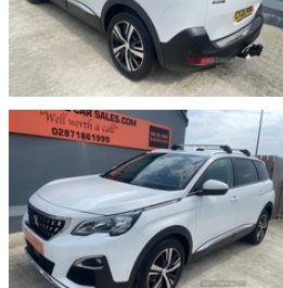
One Owner from new